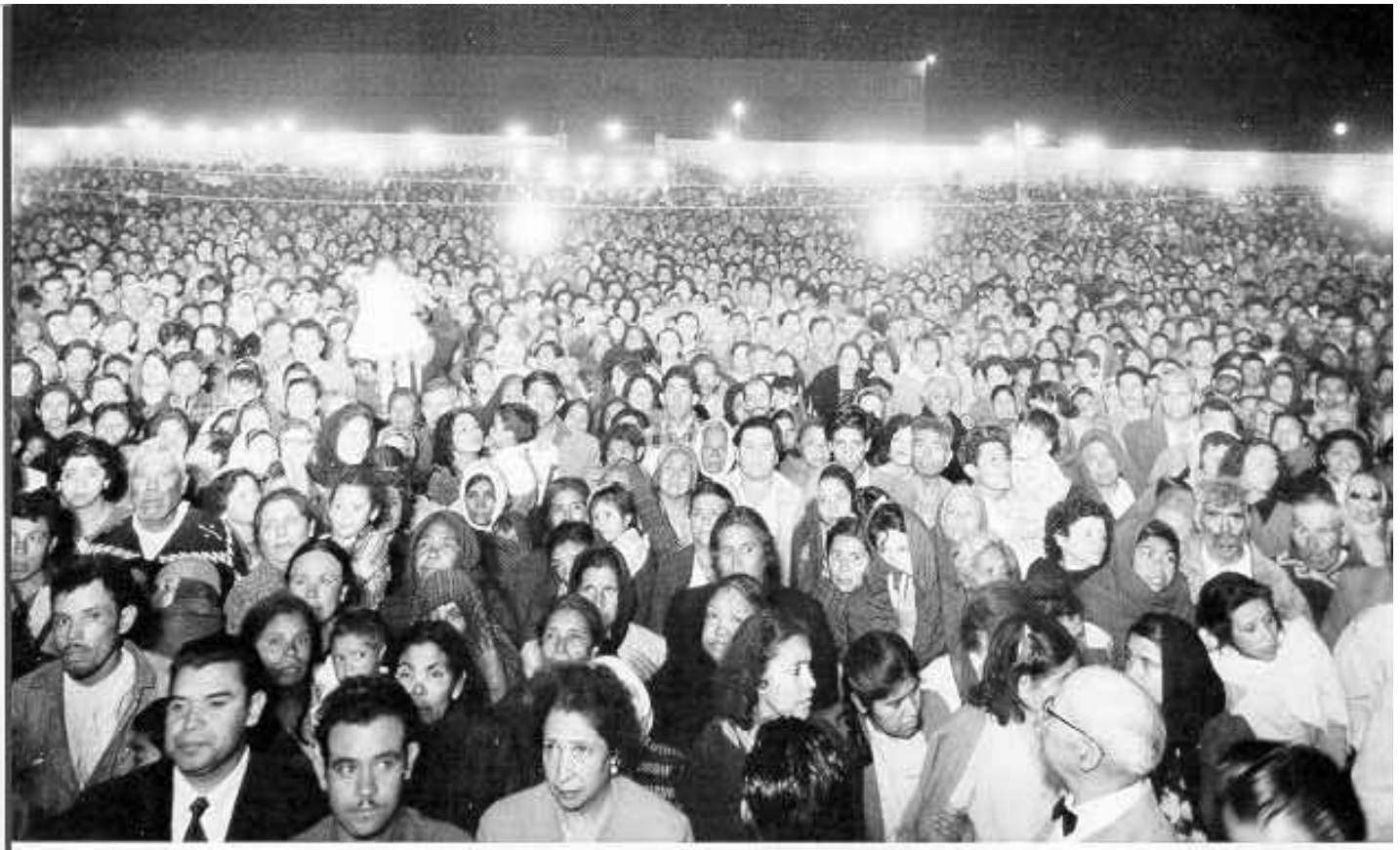
A portion of the crowd gathered for Brother Branham's meeting in Mexico City, April, 1956.