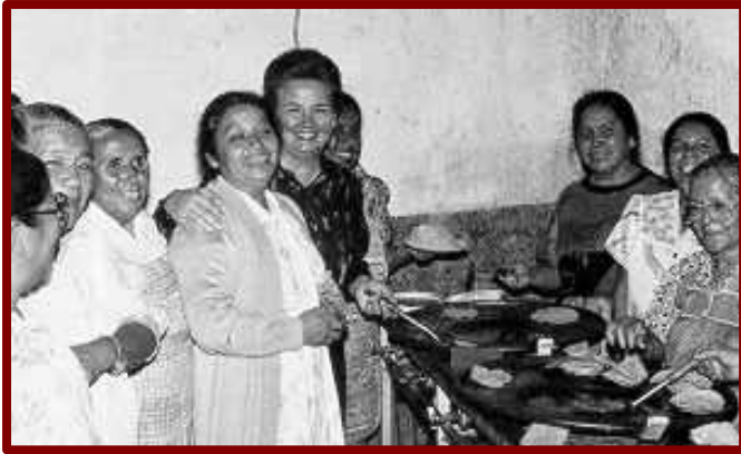
The sisters were surprised to learn that I was no novice at preparing Mexican food.

Through the pages of this JOURNAL, I would like to introduce you to some new-found members of our universal family.