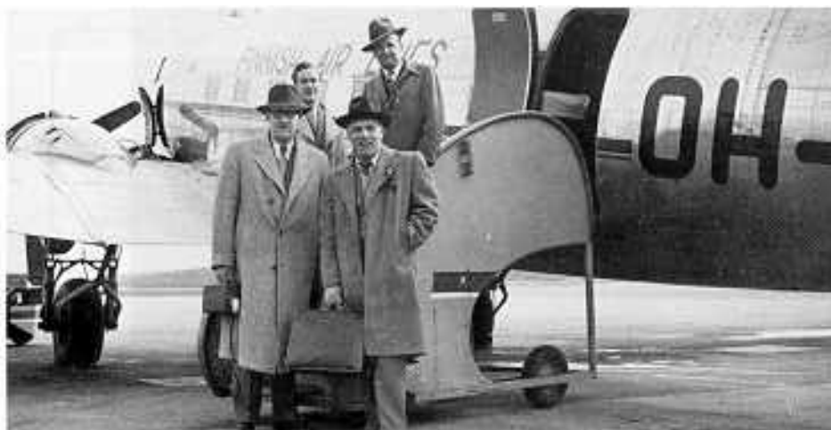
Arriving in Finland, April 14, 1950. Brother William Branham (top of

The following article is reprinted from a special overseas edition of The Voice of Healing magazine, published in June, 1950.